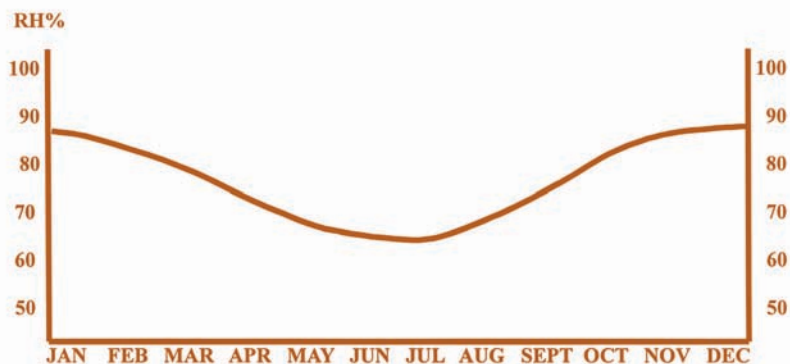
Graph 1: Seasonal relative humidity for coastal British Columbia, Canada.

After initial conditioning has taken place, timing can greatly affect the results. If a roof is installed during a season when the humidity and EMC are high, then the shingles that bridge the gap between panels will experience tension as the panels shrink slightly to adjust to the lower EMC of their annual cycle. No buckle would result in this situation. Conversely, shingles that are installed during the low end of the annual RH cycle will experience compression as the cycle progresses to higher moisture content. A shingle buckle is inevitable.