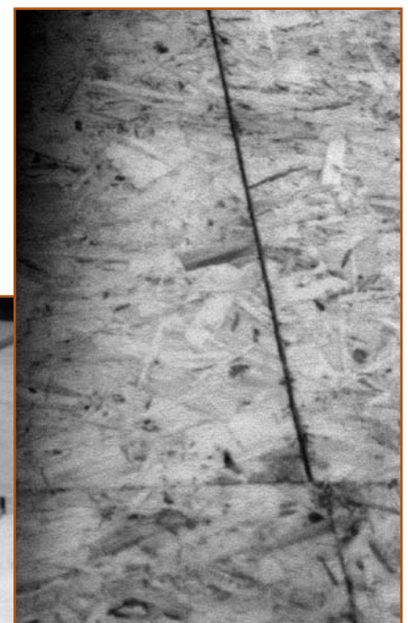
Above: Photo 4: OSB panels are customarily spaced with the shank of a nail.

There is a precedent, just as lumberyards at one time stickered boards to decrease their moisture