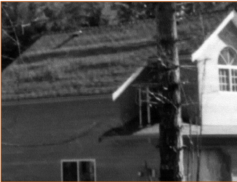
Photo 2: Severe sheathing distortion may be viewed on this unfinished home.

12% - 19%, depending on climate zone and season. It is for this reason that, during sheathing installation, it is recommended that a 1/8" gap be left between panels. This gap is to prevent buckling and distortion of the sheathing panels as they adjust dimension to match their in-service EMC. It is frequently interpreted that this gap is necessary to prevent shingle buckling. Exactly the opposite is true. It is because we leave this gap that shingle buckles occur. As the panels adjust their moisture content, they expand slightly in their linear dimensions. A shingle that bridges the gap between panels is put under compression as the nailing points move close together. To relieve this compression, the shingle buckles slightly. Very little motion of the nails is necessary to form a noticeable buckle.