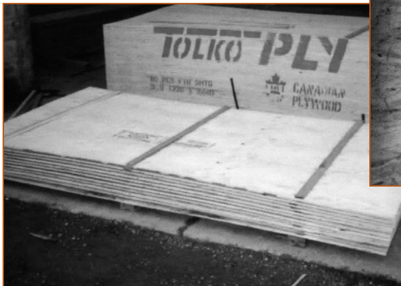
Photo 3: "Stickering" helps to pre-condition the sheathing prior to application.

This is contrary to the popular notion that the shingle buckle is a reflection of the swelling in thickness of the panel edge, although this does occasionally happen. When sheathing is being installed, H-clips are often used for edge support. This leaves a uniform space between the sheets on the long edges as recommended in APA and SBA technical bulletins. In spite of the recommendation that the ends of the plywood panels also be spaced, this is often ignored during field application. This would explain why shingle buckles are generally only observed on the long edges where there is some freedom of movement. With the plywood end edges in